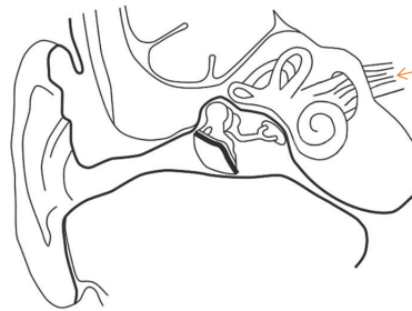
Figure 1 Area inside the inner ear where tumours grow

A Computed Tomography (CT) or Magnetic Resonance Imaging (MRI) scan can show the presence of an acoustic neuroma, even those that are still in the internal ear canal (Figure 1).