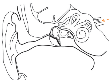
Figure 1 Area inside the inner ear where tumours grow