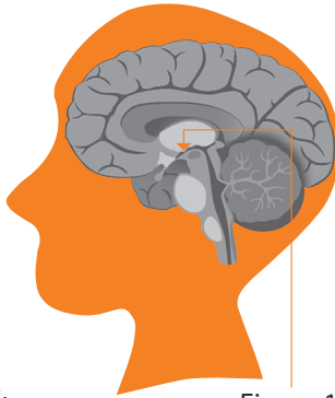
Figure 1 Substantia nigra, Dopamine-producing cells

Dopamine is produced in a structure of the brain called the substantia nigra (Figure 1).