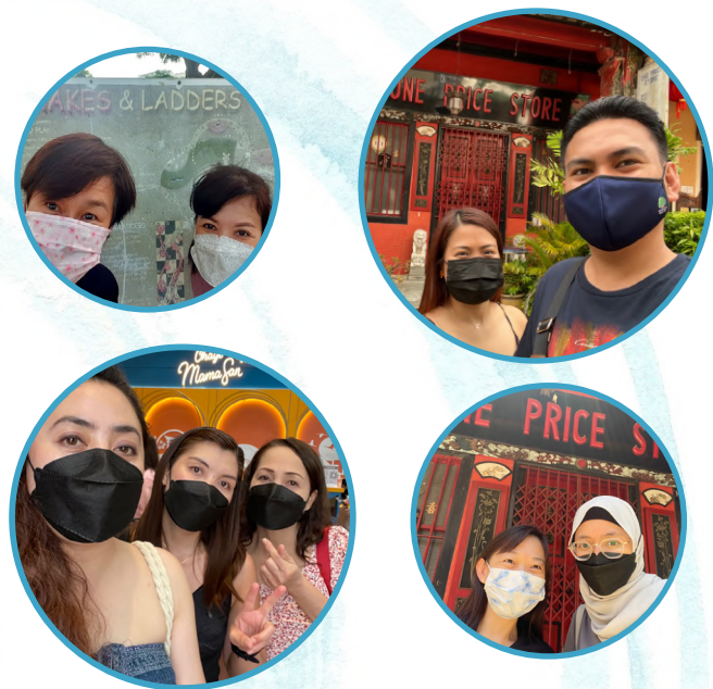
Race participants completing their challenges at the race stations