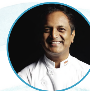
MANJUNATH MURAL ADDA Restaurant

The video series featured recipes from the 'One Heart, One Mind' recipe book which was specially curated for NNI's 20th anniversary in 2019. The celebrity chefs and their restaurants also contributed over $1,400 worth of dining vouchers for winners of the contest conducted in line with the video series which concluded in 2022.