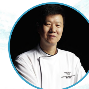
ZENG FENG Si Chuan Dou Hua Restaurant *