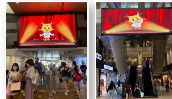
Video of Denni, NNI Fund mascot, on the screens at 313@somerset

Our mascot – Denni, made a trip downtown to the LED screens at 313@somerset during the school holidays in September 2021.