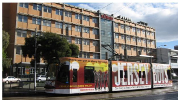
The Alfred, Australia's major tertiary referral teaching hospital.