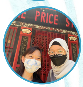
Race participants completing their challenges at the race stations