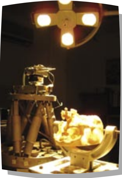
The First Prototype of Neuroμ

"...there has been a great explosion of interest in this area of neurosurgery, as it is a relatively young field. There presently exists no such robotic system that can perform image-guided robotic skull-base surgery, so this will be a pioneering first."