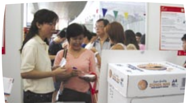
A lady participating in the quiz.