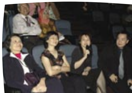
Video session at the symposium.

Movement disorders are on a rapid rise worldwide and a growing neurological subspecialty internationally, with exciting headway in the domains of genetics and clinical therapeutics. The recent establishment of the Asian & Oceania Section of the International Movement Disorders Society, where Singapore has played a pivotal role, points towards the mission of movement disorders neurologists in furthering the education, training and research of the disease in this region.