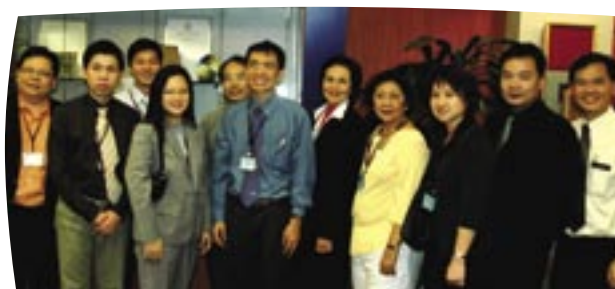
PDMD faculty and friends.