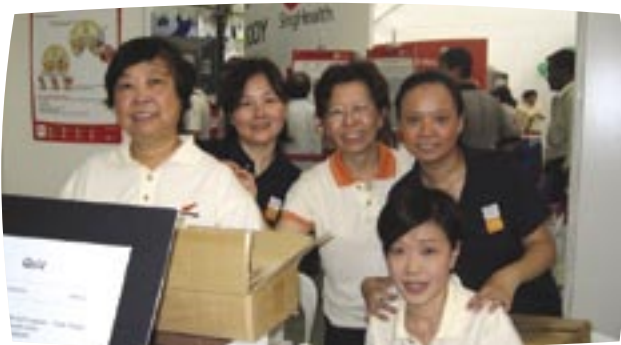
Gearing up for the public at the event.

Nurses from Nursing Admin put up posters to educate the public on stroke and epilepsy. 2 questions from each category were put across to the public to assess how much they know about the conditions. Most were able to give the correct answers. However, when it comes to management of seizures, many still believe wrongly that placing a spoon into the mouth will help the victim. Through the event, we understand better what is lacking in the public's knowledge about certain health concerns and the importance of creating public awareness in managing these conditions.